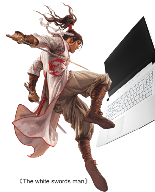
《The white swords man》