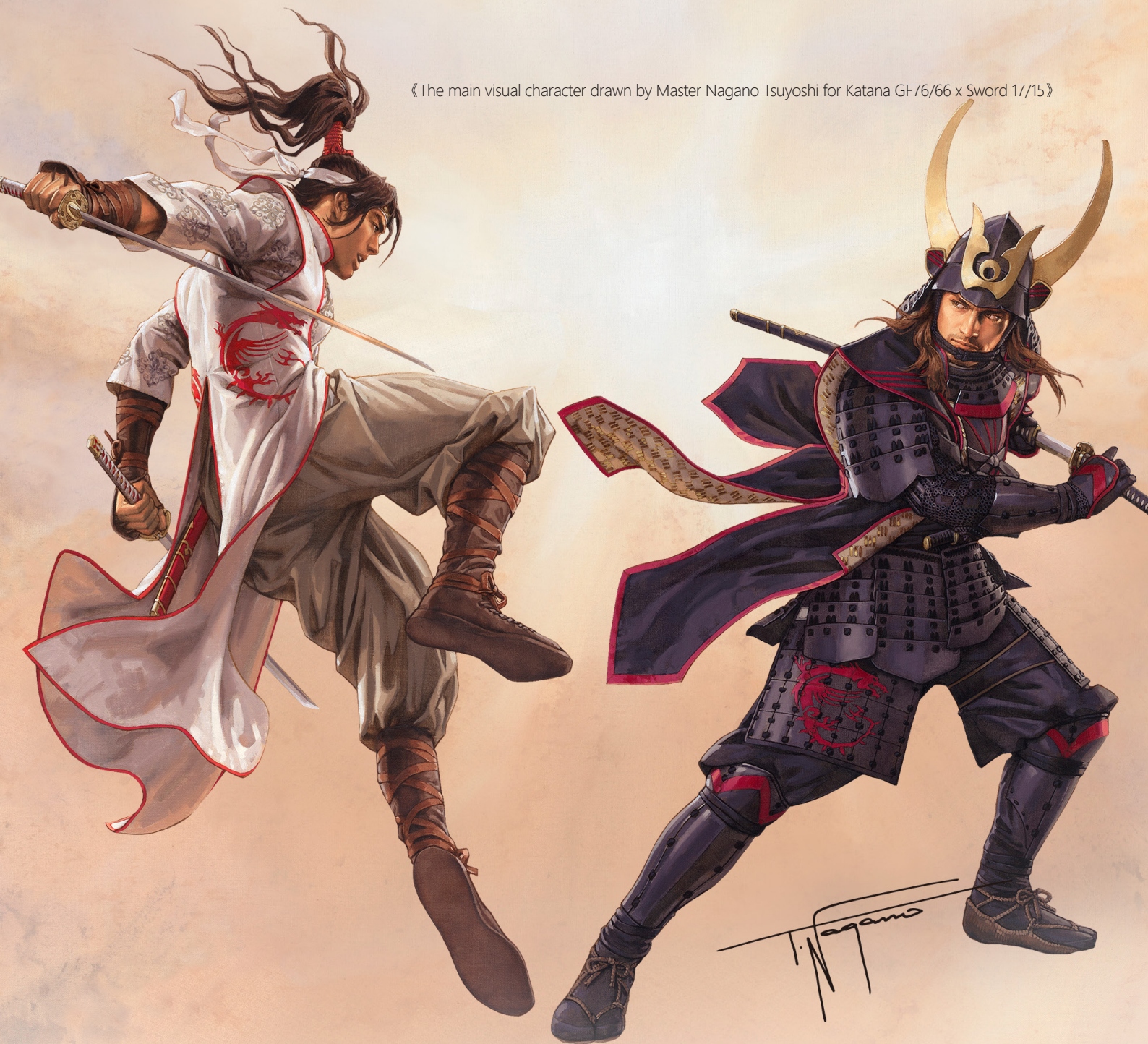
《The main visual character drawn by Master Nagano Tsuyoshi for Katana GF76/66 x Sword 17/15》