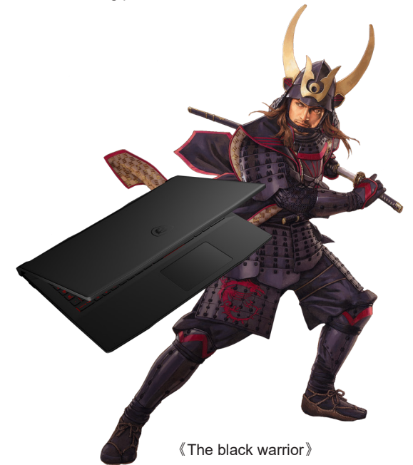
《The black warrior》

The white swords man with dual swords in an agile combat pose represents the sharpness and light-weight of GF series; the black warrior in full armor shows the toughness and stability of the chassis. The eye-catching dragon logo has also been embedded as family crest totems. The powerful performance of Katana GF66/76 and Sword 17/15 will be release once their blade unleashed.